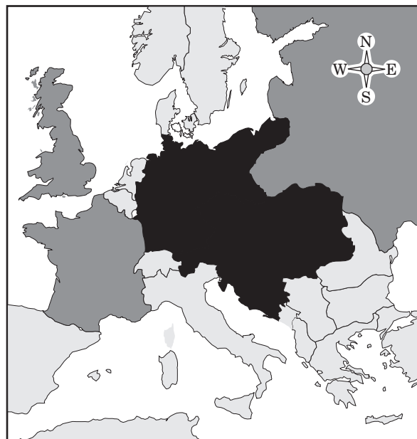
Europe Before World War I